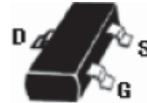
SOT-23 top view